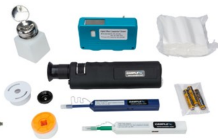
Complex CMX-TL-1601 Fiber Optic Cleaning Kit