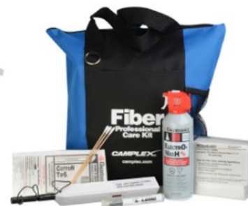
Complex FIBERCLEAN-1 Fiber Optic Cleaning Kit for LEMO Type SMPTE 304/311M Hybrid Connectors