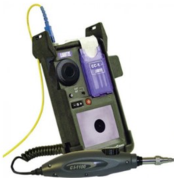
Lightel Fiber Optic Video Microscope